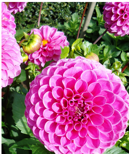
Autumn Dahlias at the Royal Botanic Gardens, Dublin