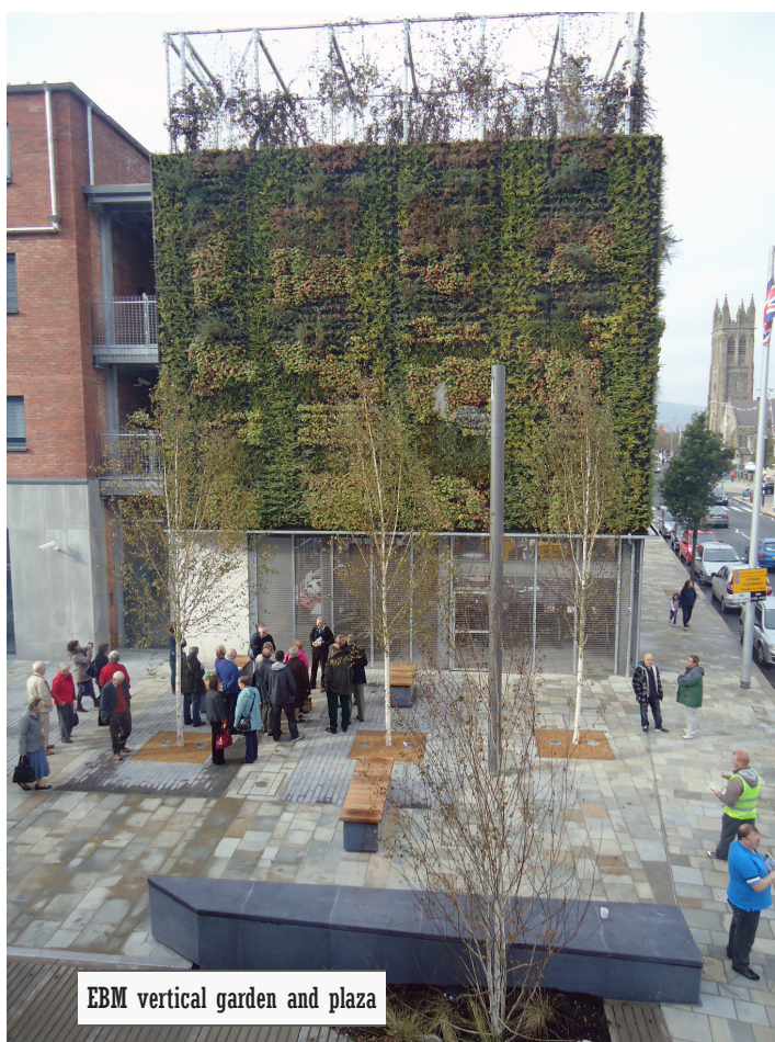
EBM vertical garden and plaza

residency in a storefront on the Shankill Road with her art making. She is the one we went to the art therapists' meeting to hear