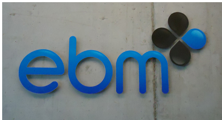
East Belfast Mission logo in their new offices on the Newtownards Road

The last newsletter ended with a promise to talk about our new sponsor and the Skainos project. We are very proud to be associated with East Belfast Mission (EBM) and hope to learn from, contribute to, and multiple their ways. EBM is a Methodist organization on the Newtownards Road in loyalist East Belfast just across the river from where we are in North Belfast. This is the area of the former dock and shipyard workers. The shipyard faltered and nationalized in 1977, and went from a high of 35,000 to now 500 employees. The Troubles ensued for 30 years. EBM provides social services such as a recycle shop, a homeless shelter, advice and job assist, and childcare facilities. A small church