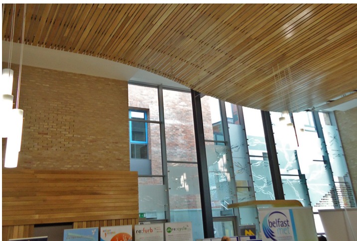
Skainos multi-purpose room used for EBM church worship on Sundays