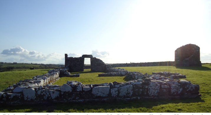
Ethel took us to Scrabo Tower, then to this 5th Century Nendrum Monastic site

The Border Agency regulations do not permit us to technically start our