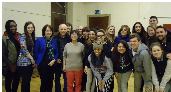
The LMU group fully recovered from jetlag on their final night

The best news is Ward's book of poetry and prayers titled Plain Drink Tea was published on 12 March and is available on Amazon.com and Amazon.co.uk. Please consider buying a copy and providing a review. You can read a bit of it online and there is a Kindle version.