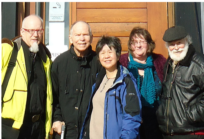
Five friends on a Patrick tour starting at the Patrick Centre, Downpatrick