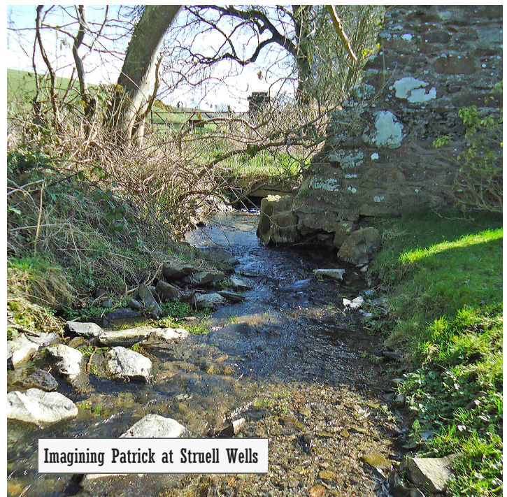
Imagining Patrick at Struell Wells