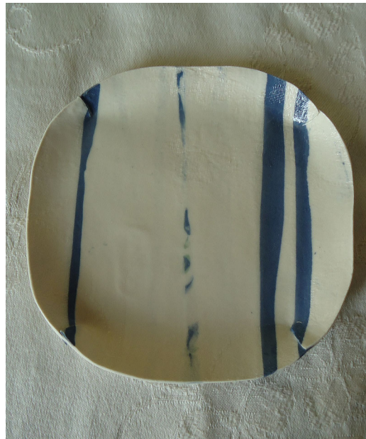
Not doing much pottery but did make some with blue